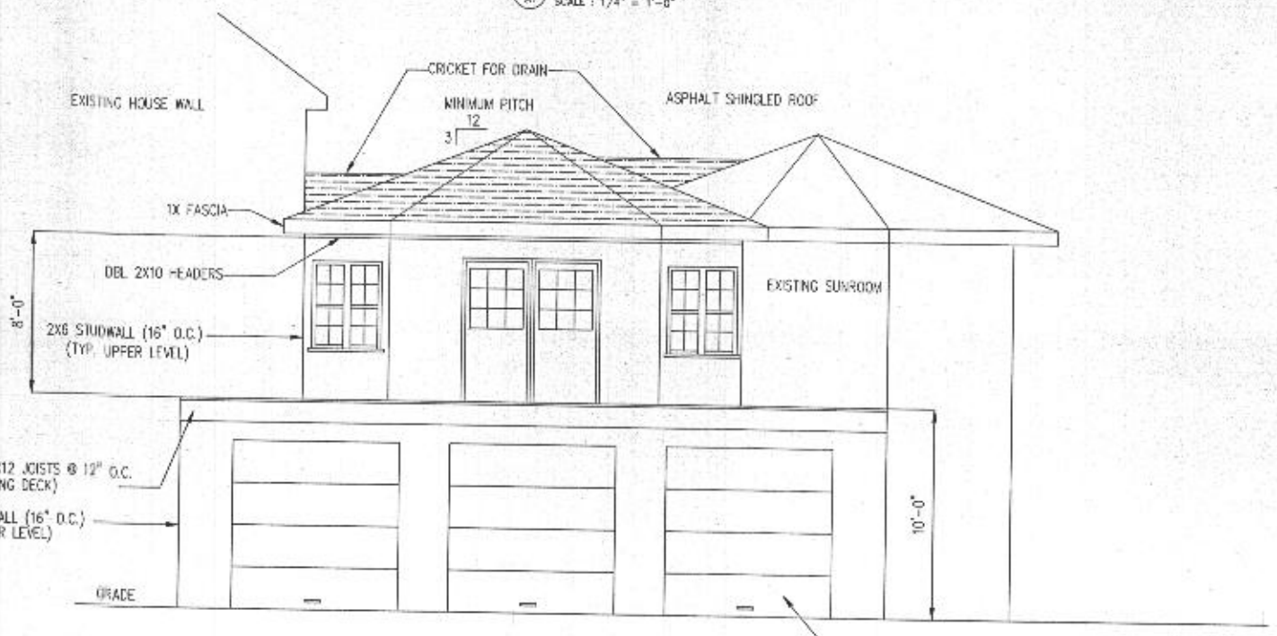
02 ELEVATION SCALE: 1/4" = 1'-0"