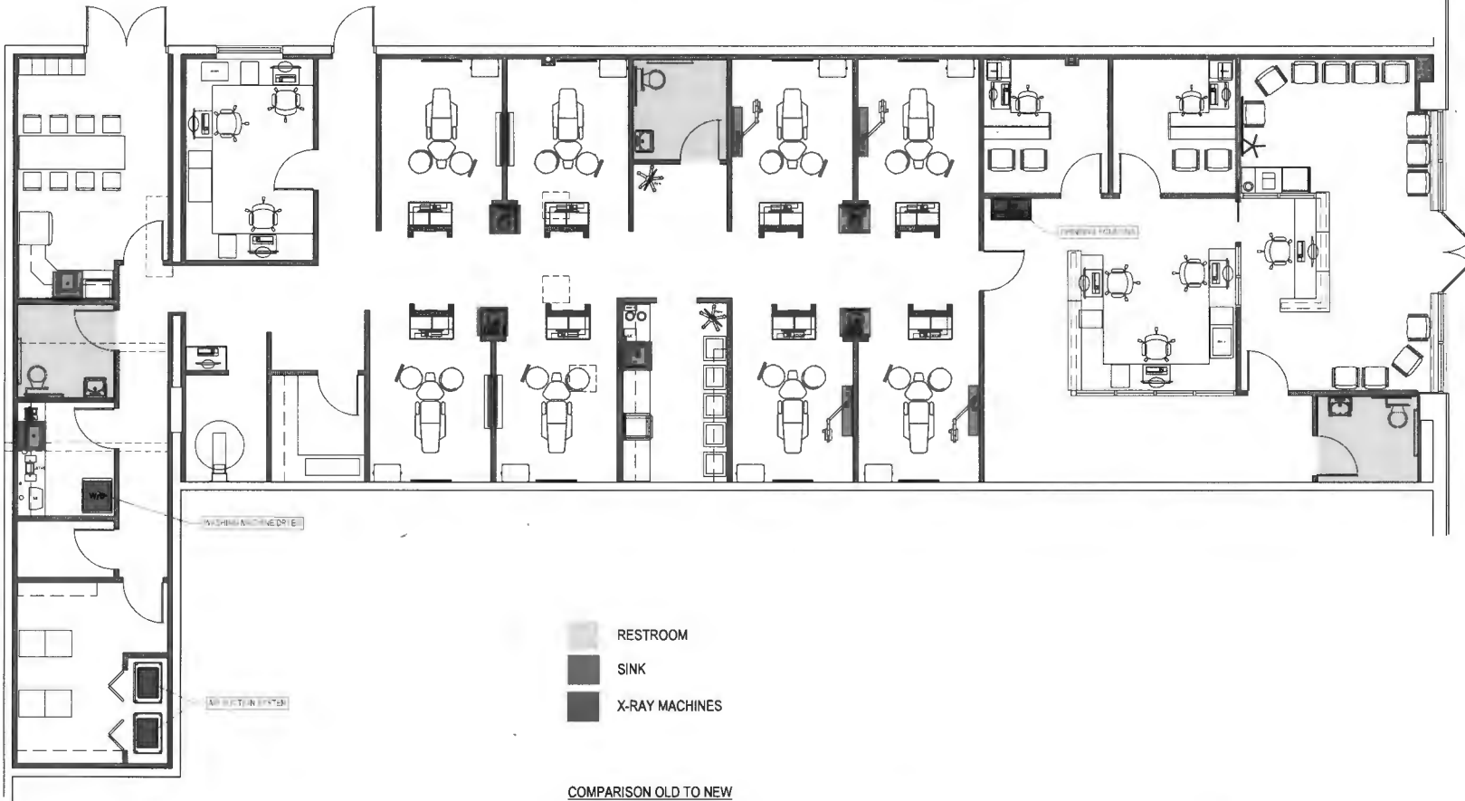
EQUIPMENT FLOOR PLAN 1/4" = 1'-0"