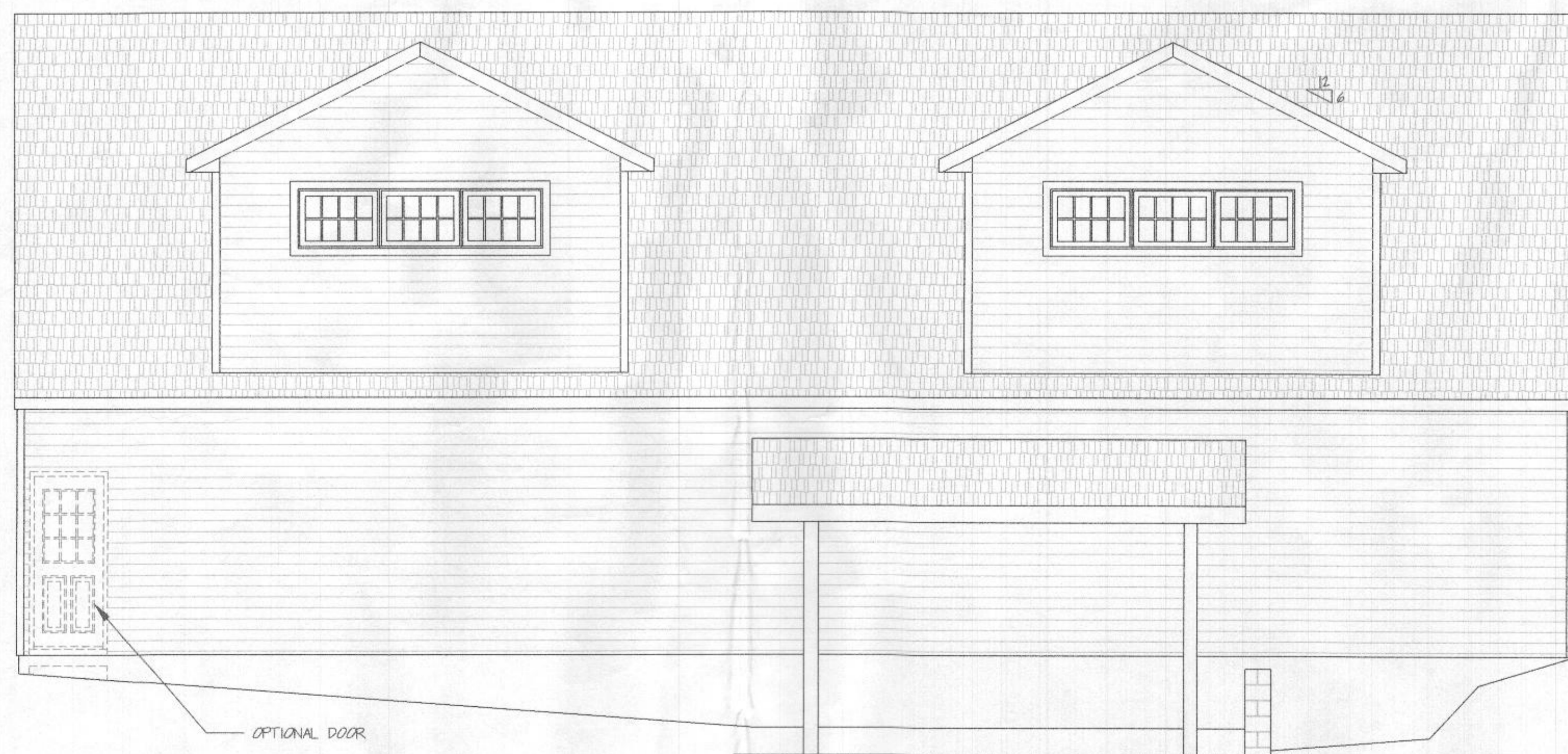
3 PROPOSED GARAGE REAR ELEVATION 1/4" = 1'-0"