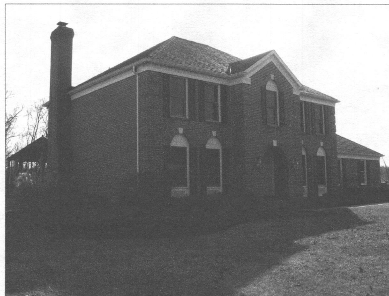
VIEW OF LEFT FRONT OF EXISTING HOUSE (N.T.S.)

NOTE: QUOINING TO REPLICATE EXISTING CONDITIONS. FIELD VERIFY. AS PER CLIENT'S RECOMMENDATIONS.