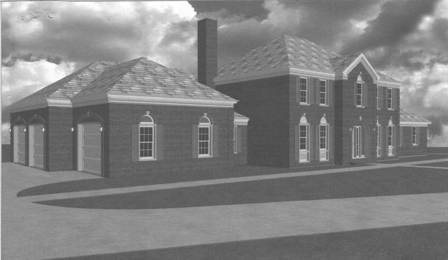
PROPOSED VIEW OF LEFT FRONT OF HOUSE (N.T.S.)