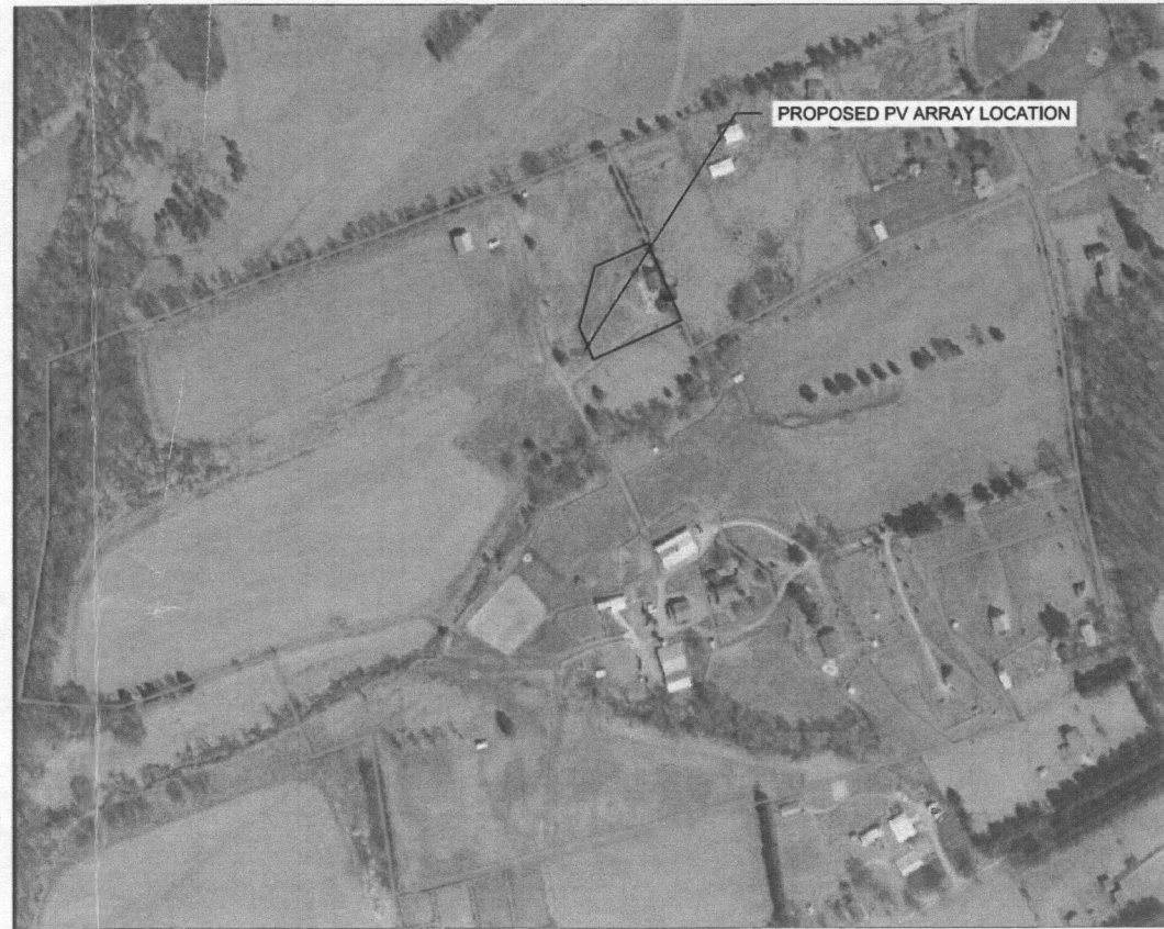
SITE PLAN Scale: 1" = 500'