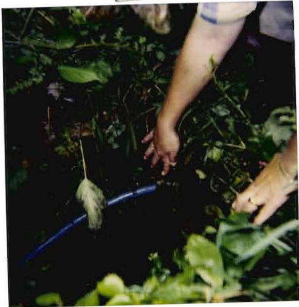
9-27-94 5:00 pm 1435 Marriottsville