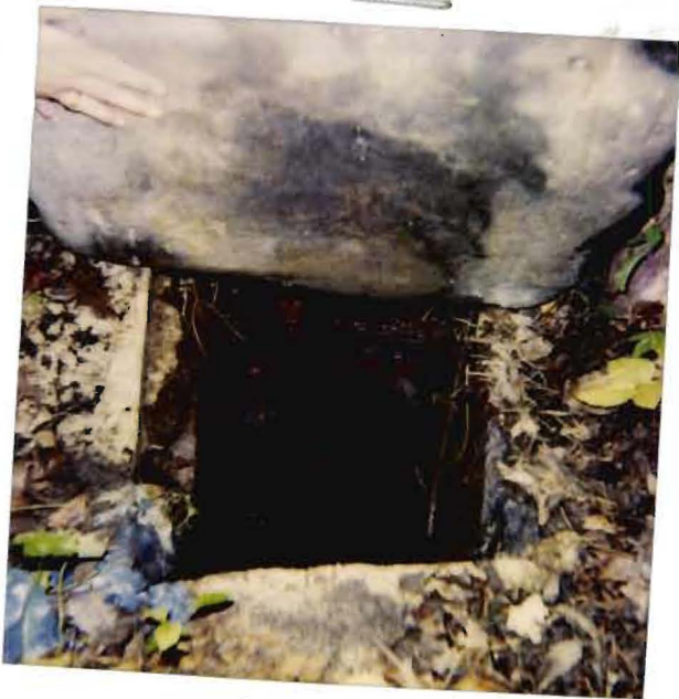
9-27-94 5:00 pm 1435 Marriottsville Rd