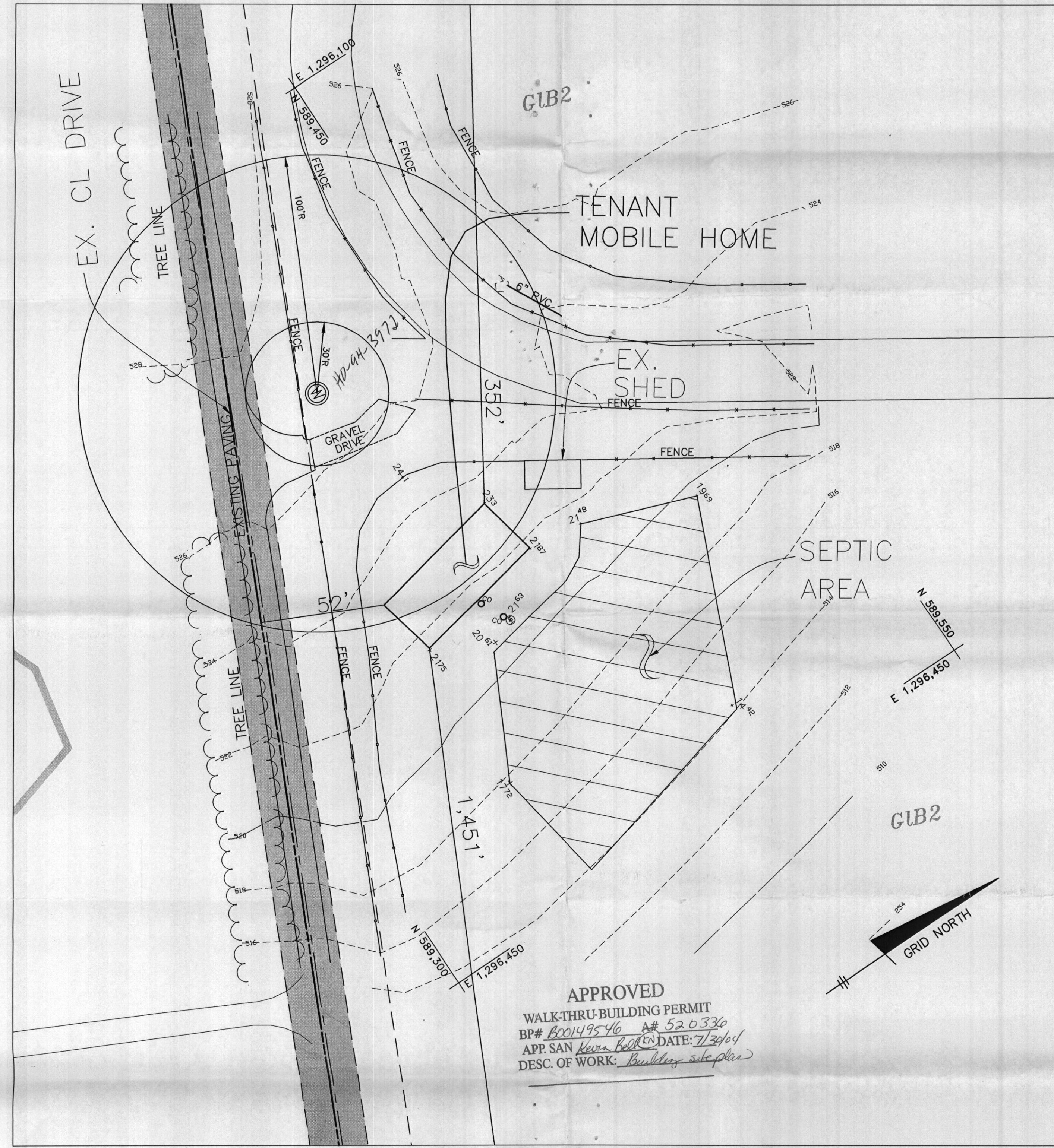
PLAN SCALE: 1" = 30'